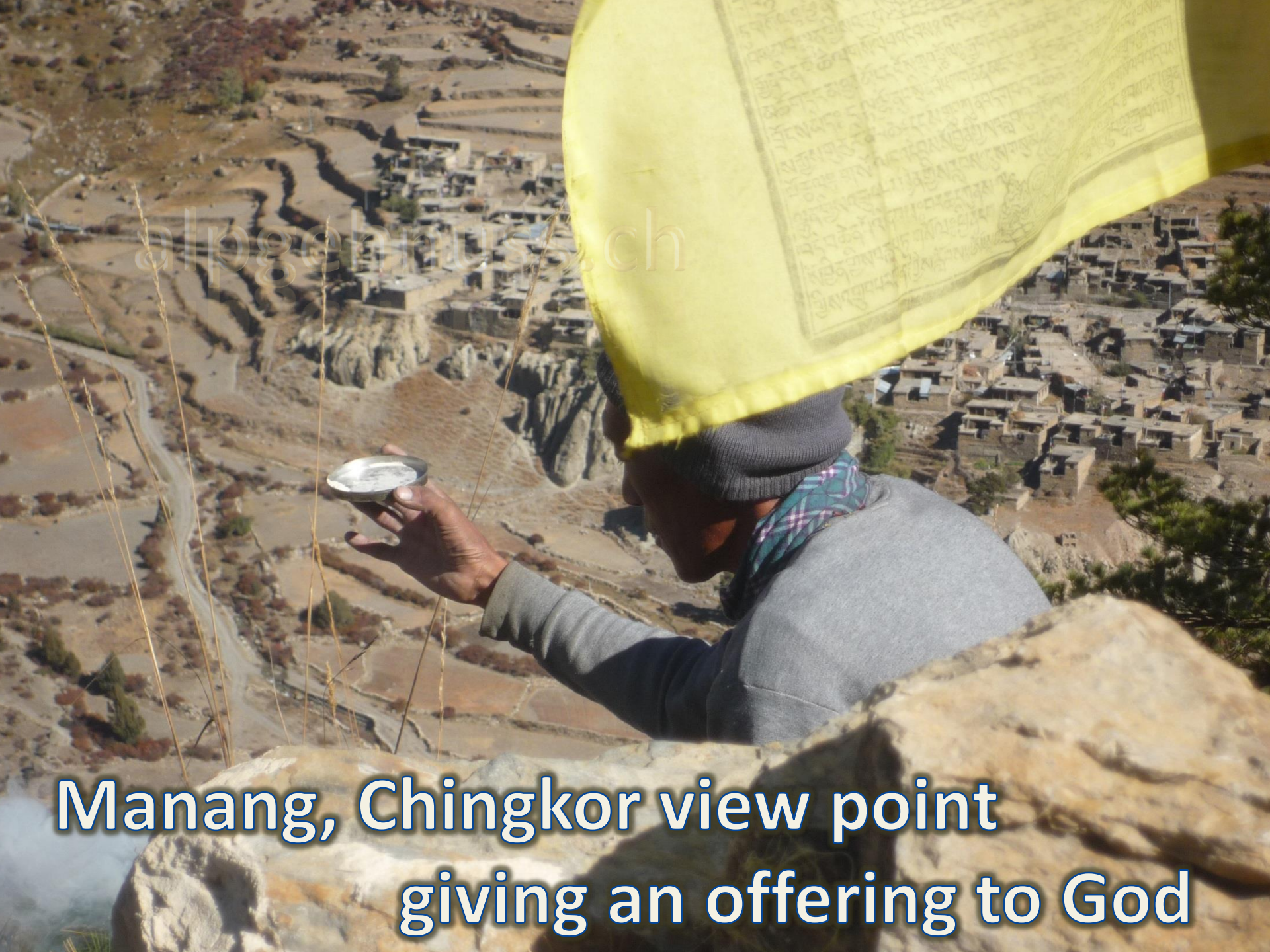
Manang, Chingkor view point giving an offering to God